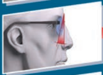
The Pantoscopic angle