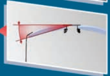
Curvature angle of the frame