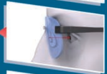
Distance between the pupil and the lens