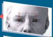
Distance between pupils