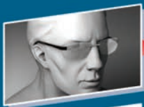
The client's individual prescription (Rx)

Individualisation in accordance with the client's personal parameters is the key benefit of these lenses. The manufacture of individualised progressive lenses takes into account the following: